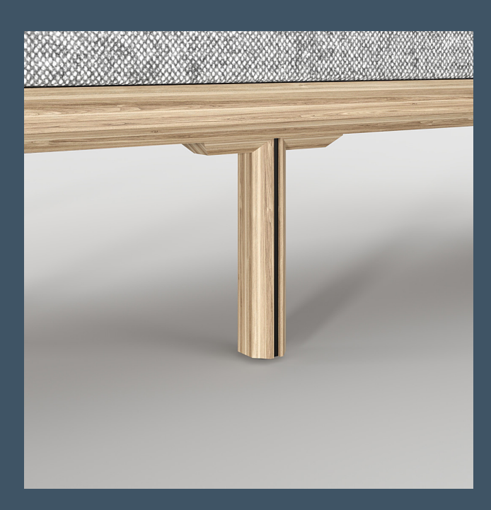
LEG STYLE 4