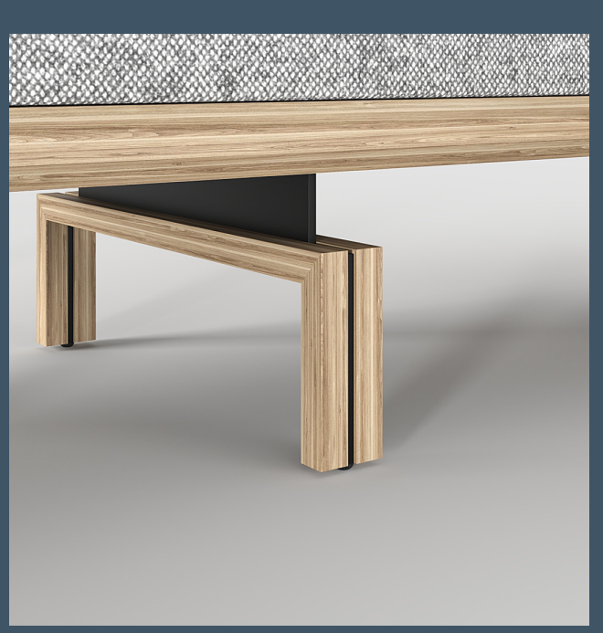
LEG STYLE 7