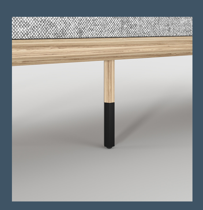
LEG STYLE 6