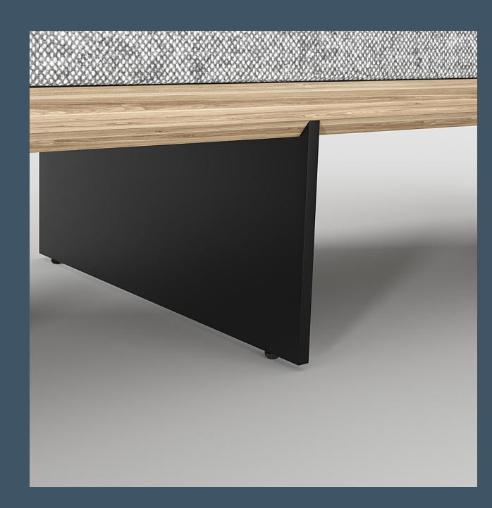
LEG STYLE 3